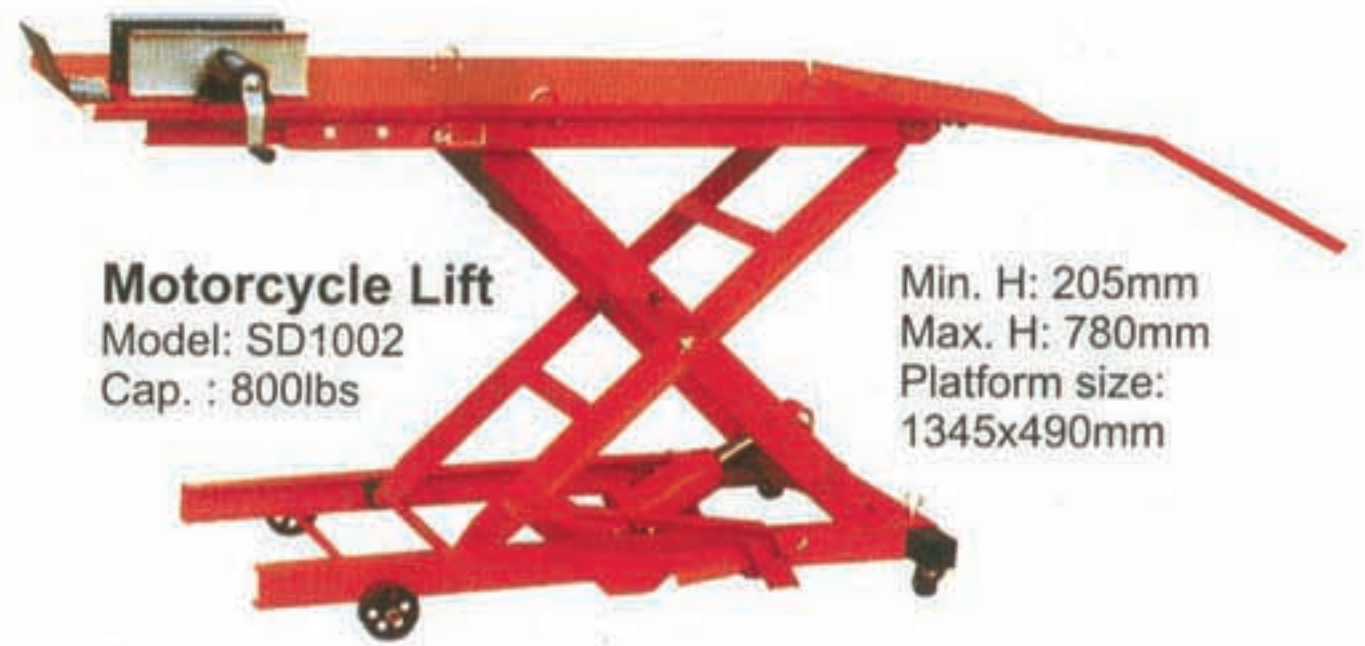
Motorcycle Lift Model: SD1002 Cap. : 800lbs

Min. H: 205mm Max. H: 780mm Platform size: 1345x490mm