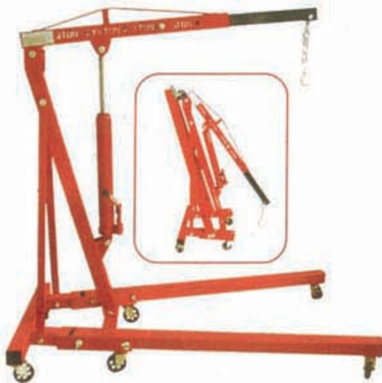
Foldable shop crane Cap: 1T/2T