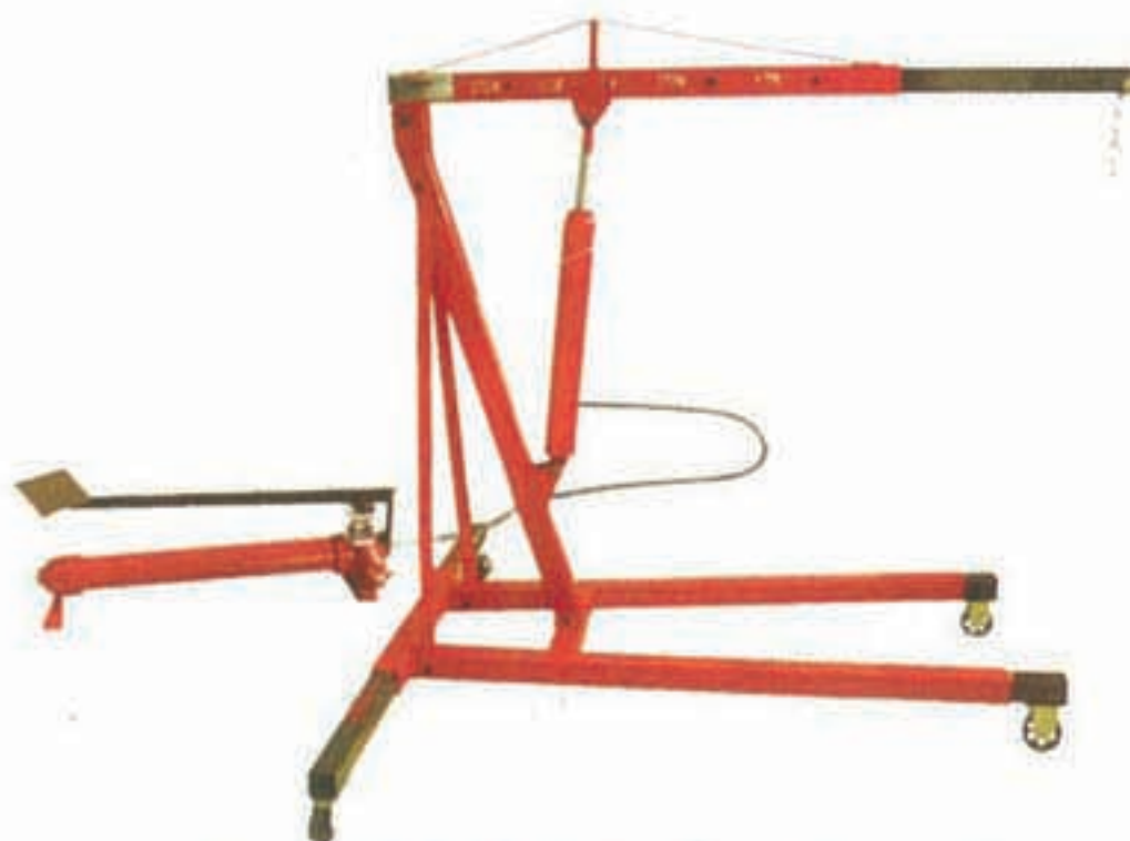
Portable power shop crane Cap: 1T/2T