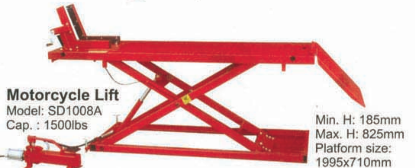
Motorcycle Lift Model: SD1008A Cap. : 1500lbs

Min. H: 195mm Max. H: 780mm Platform size: 1825x660mm