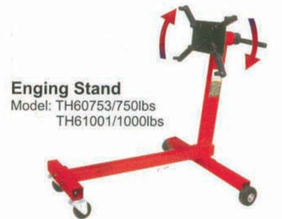
Enging Stand Model: TH60753/750lbs TH61001/1000lbs