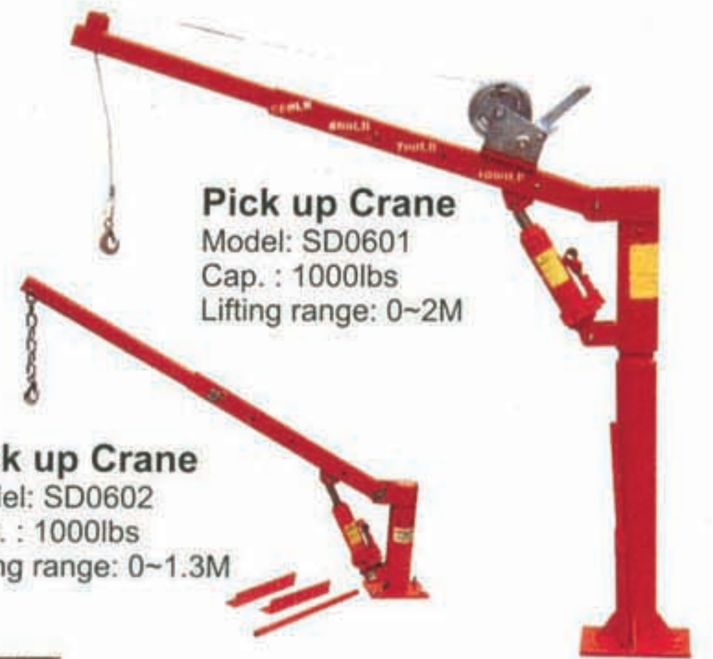
Pick up Crane Model: SD0601 Cap. : 1000lbs Lifting range: 0~2M