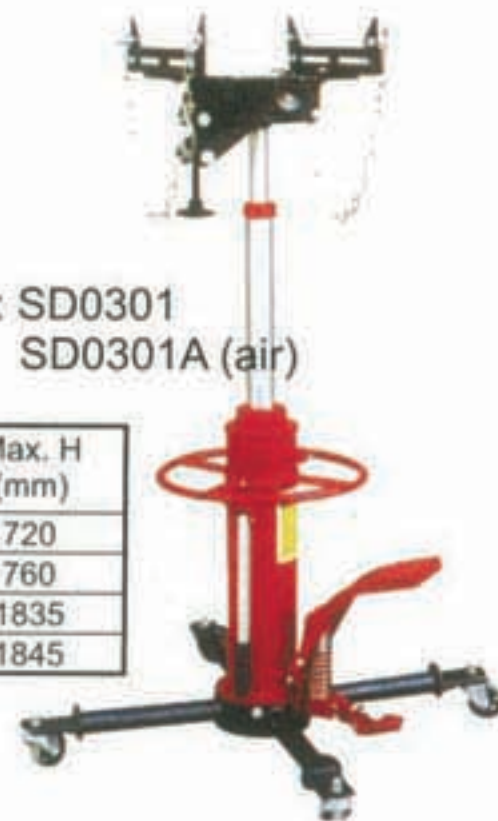
Model: SD0301 SD0301A (air)