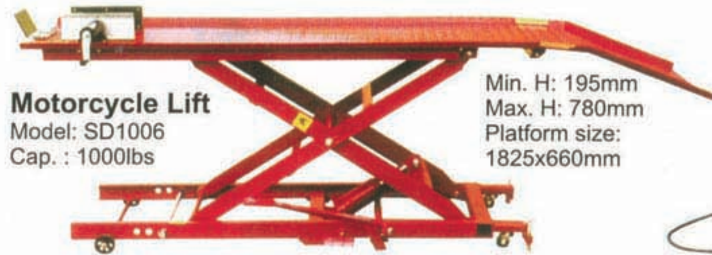
Motorcycle Lift Model: SD1006 Cap. : 1000lbs

Min. H: 205mm Max. H: 780mm Platform size: 1345x490mm